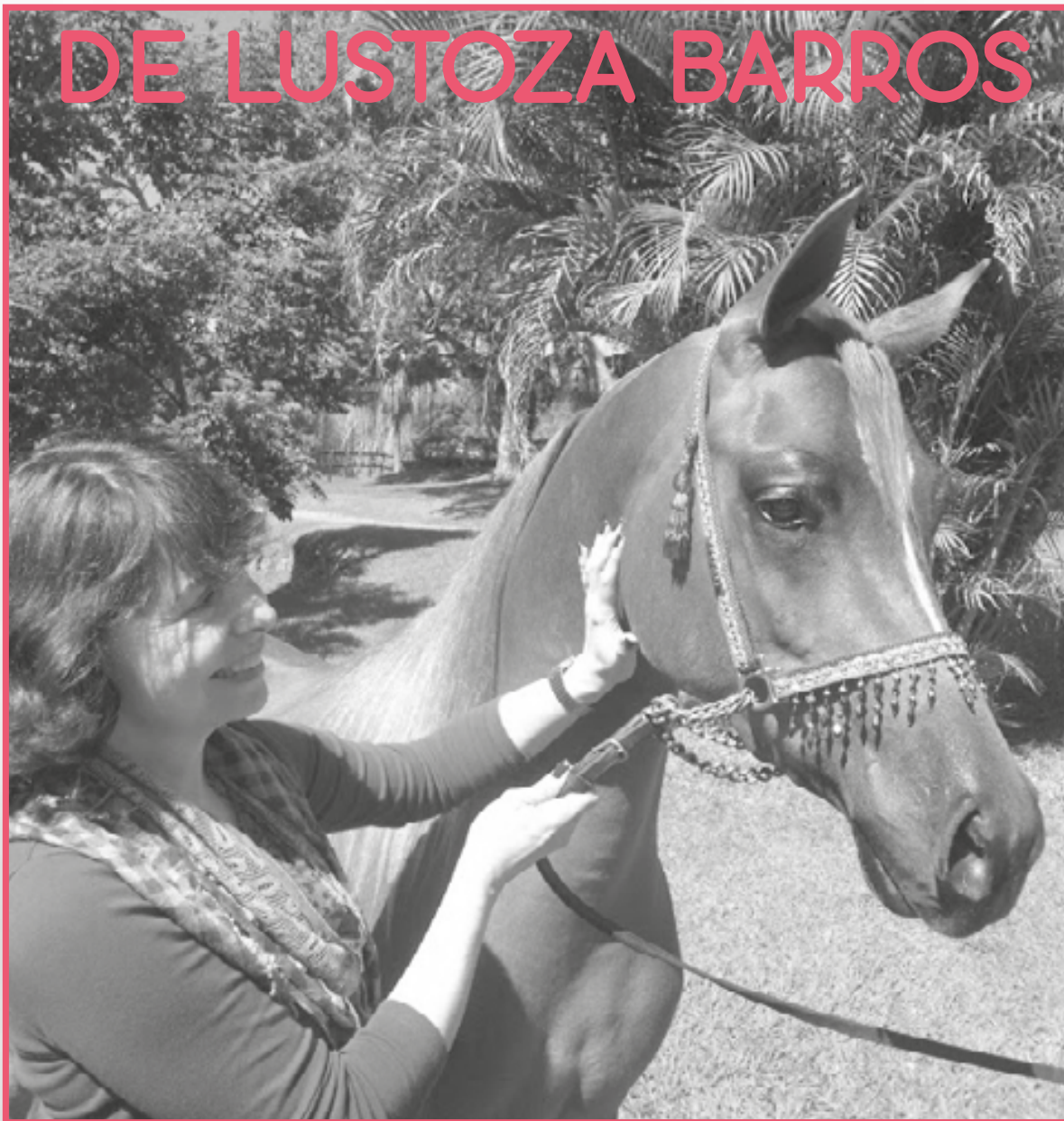
Journalist and Breeder